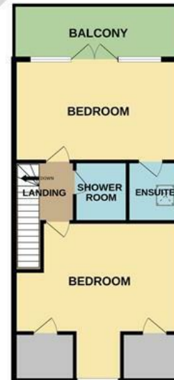
2ND FLOOR 611 sq.ft. (56.8 sq.m.) approx.