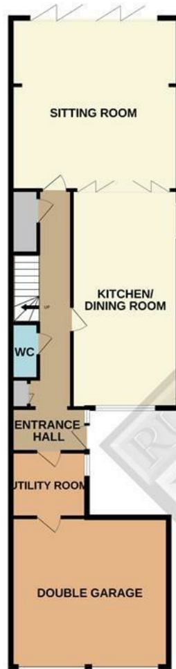
GROUND FLOOR 1110 sq.ft. (103.1 sq.m.) approx.