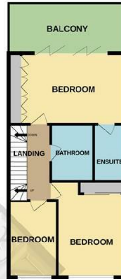
2ND FLOOR 611 sq.ft. (56.8 sq.m.) approx.